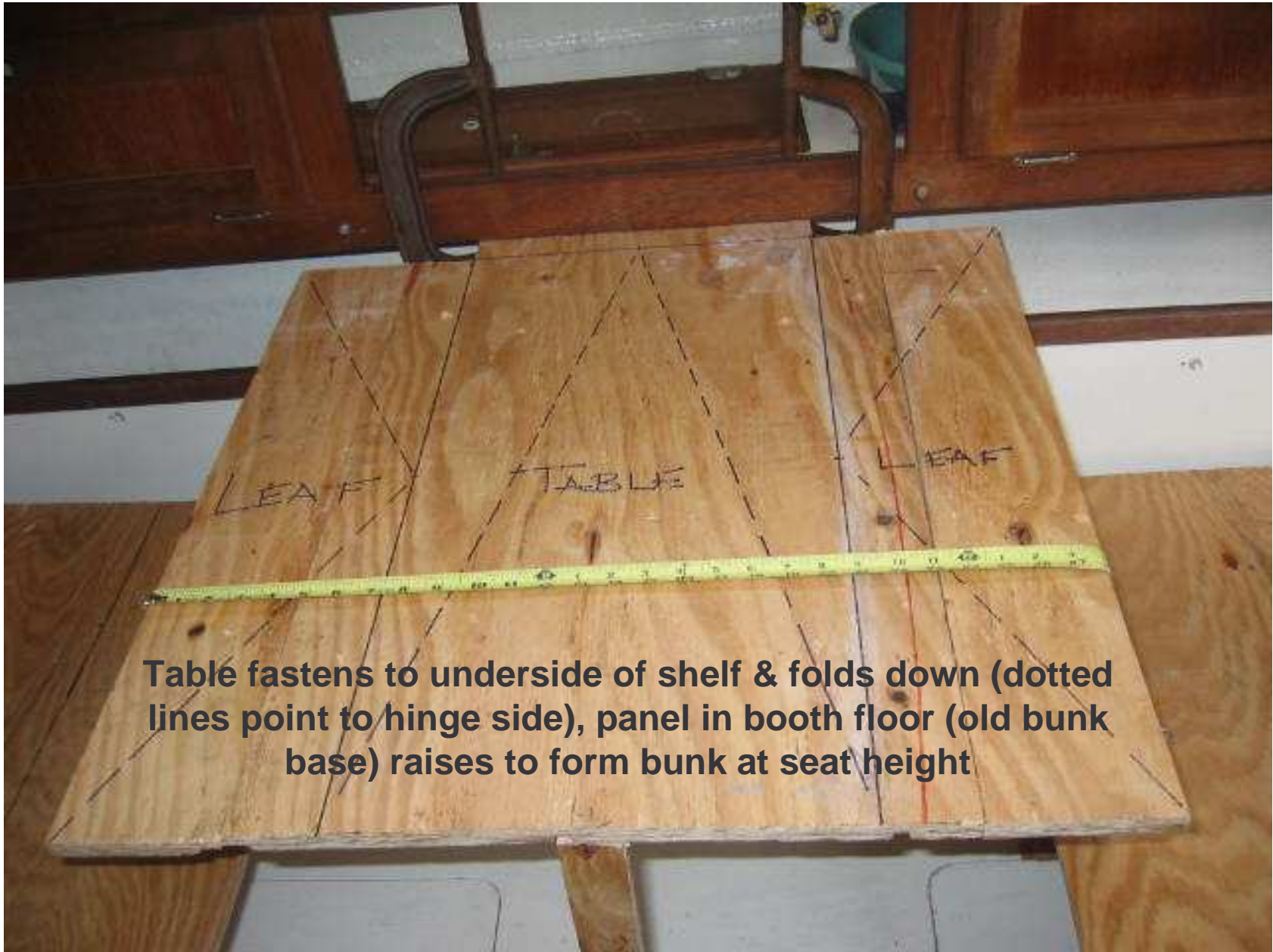
Table fastens to underside of shelf & folds down (dotted lines point to hinge side), panel in booth floor (old bunk base) raises to form bunk at seat height