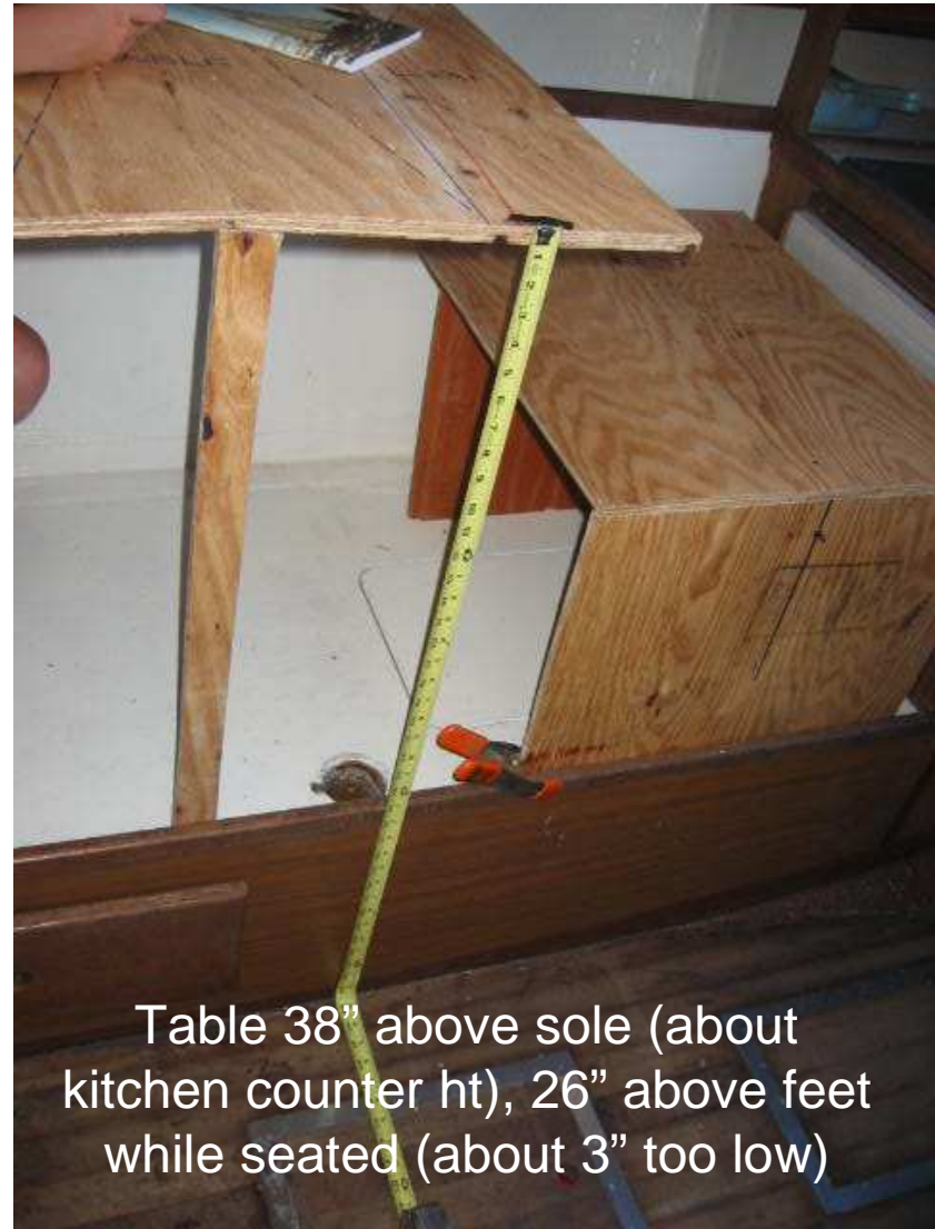
Table 38" above sole (about kitchen counter ht), 26" above feet while seated (about 3" too low)