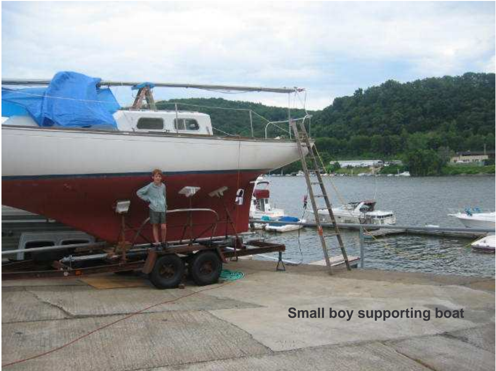
Small boy supporting boat