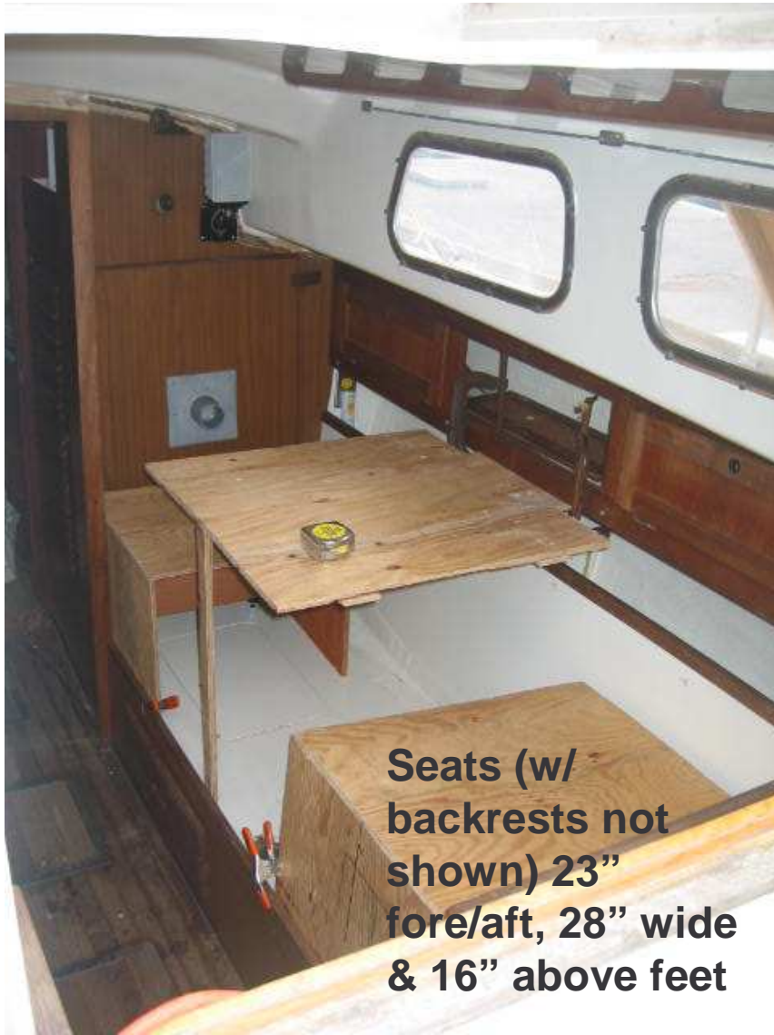
Seats (w/ backrests not shown) 23" fore/aft, 28" wide & 16" above feet