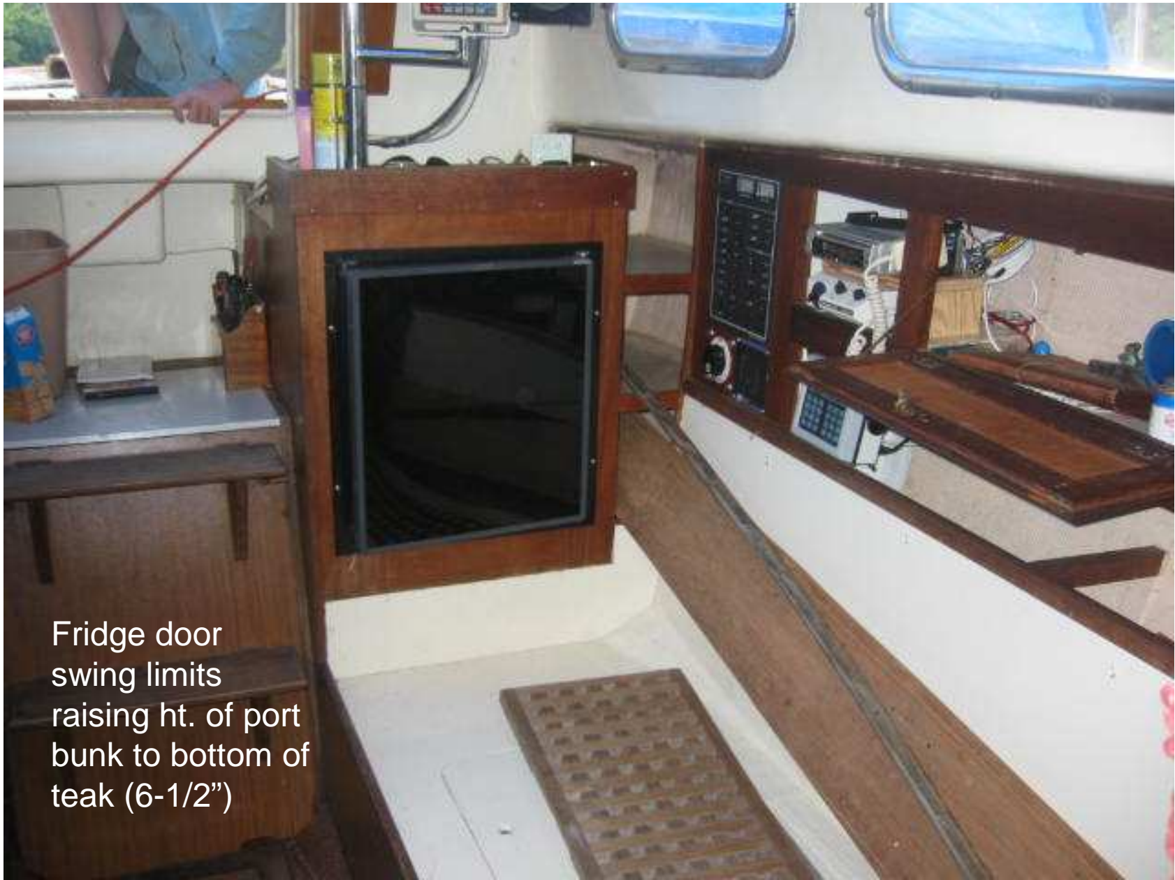
Fridge door swing limits raising ht. of port bunk to bottom of teak (6-1/2")